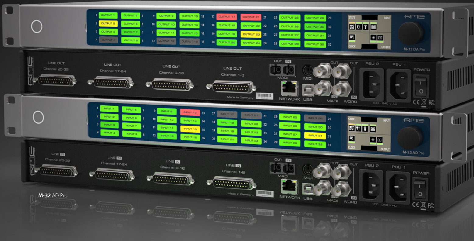
M-32 AD Pro